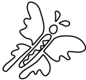
Butterfly • $600 Approximately 7" x 7"