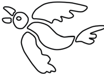
Bird • $800 Approximately 10" x 10"